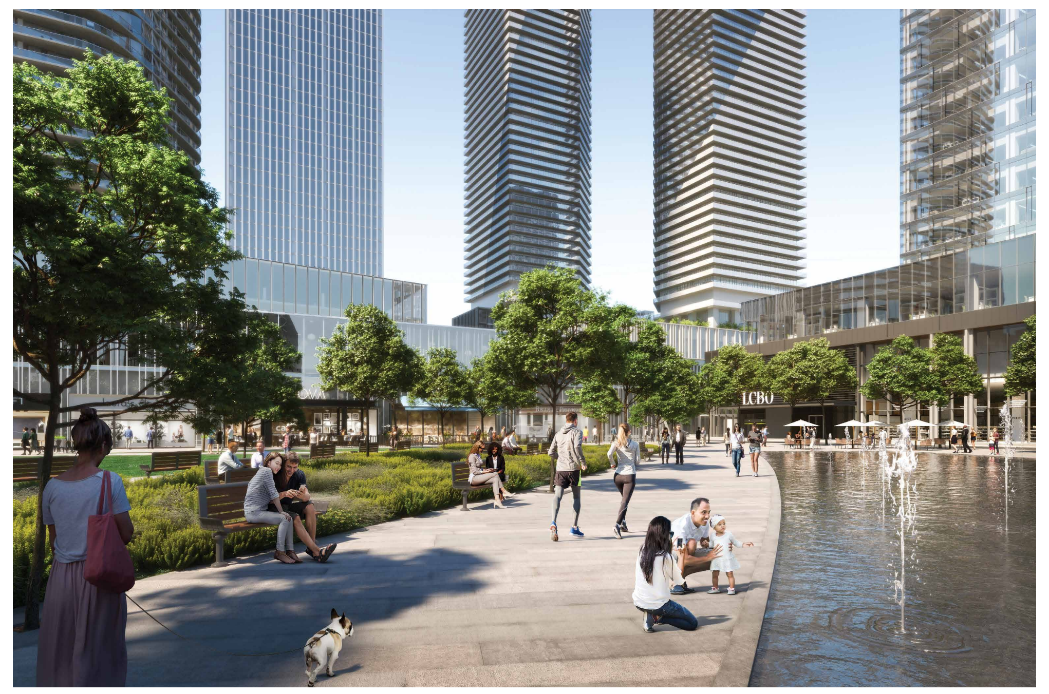
2-ACRE COMMUNITY PARK