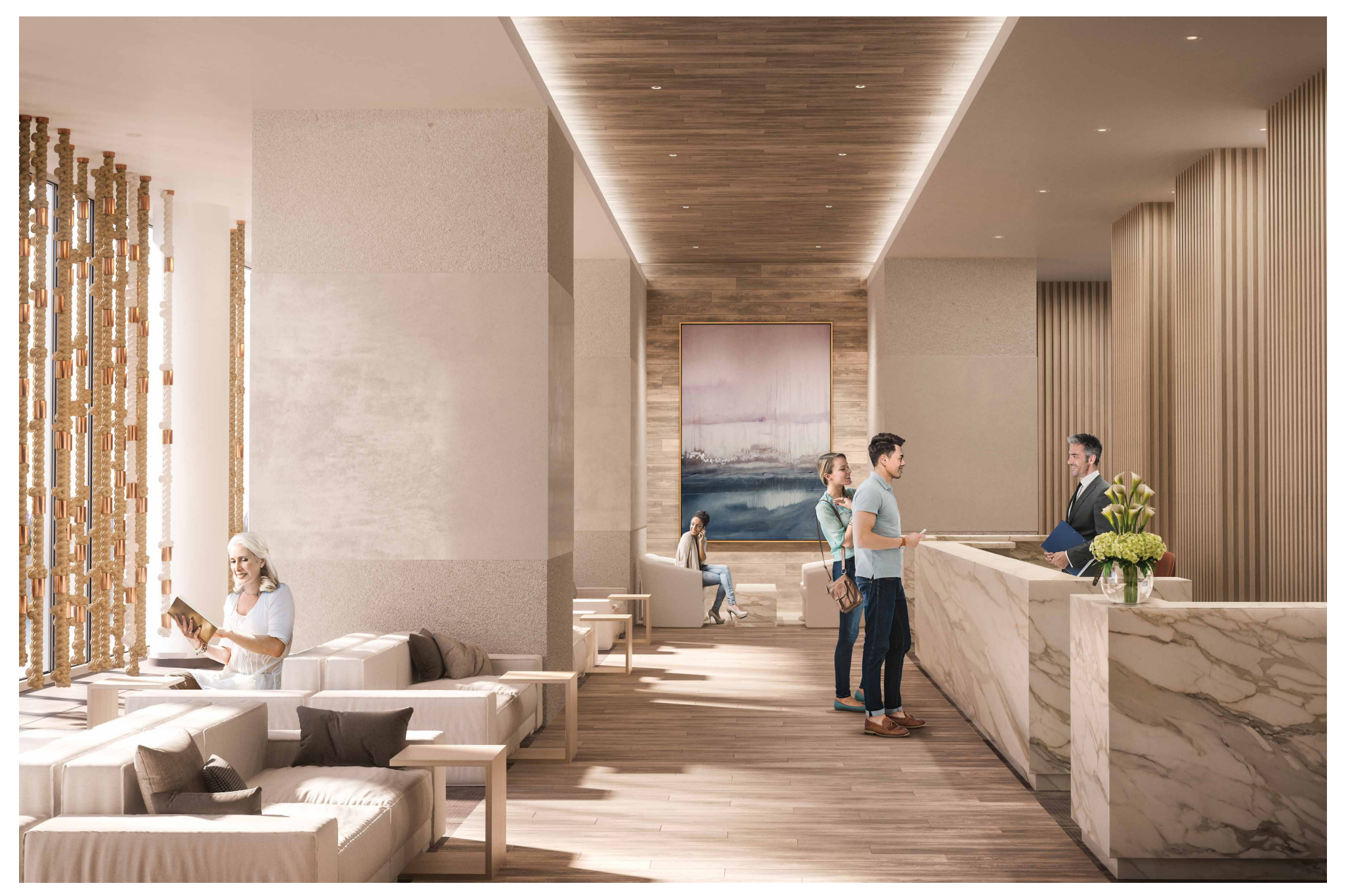
RESIDENTIAL CONDOMINIUM LOBBY