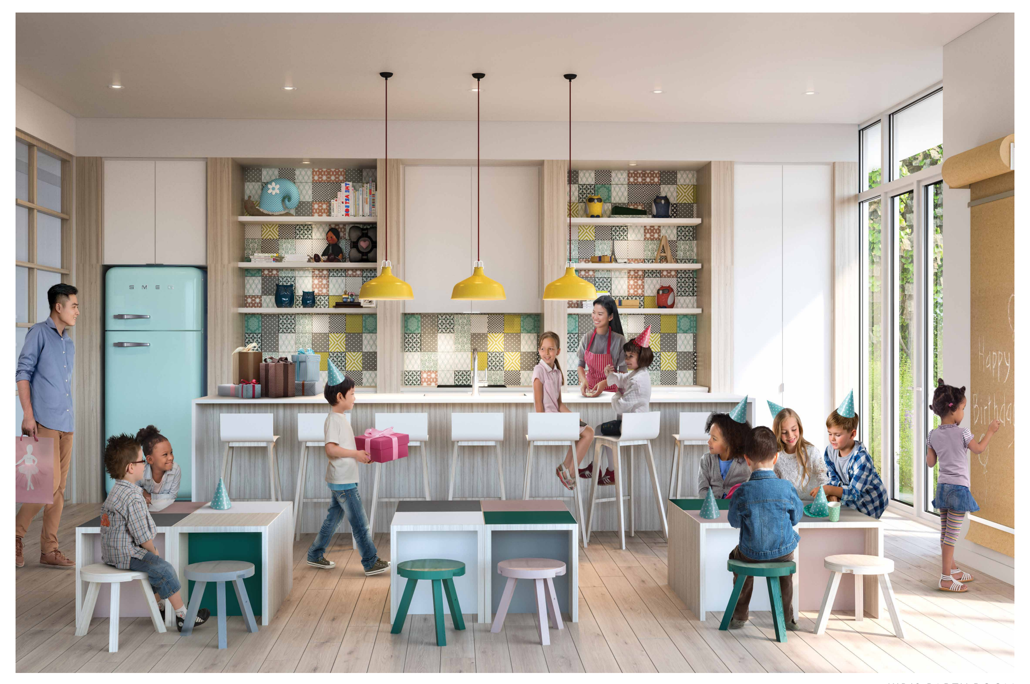
KID'S PARTY ROOM