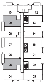
4th - 7th Floors