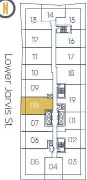
Queens Quay E. Floors 4-9